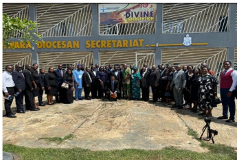
Cross Section of the PIC members and the Chairman of CAN Kwara State