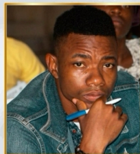
General Jesse Jackson