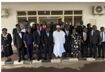
Cross Section of the PIC members and the Deputy governor of Kwara State