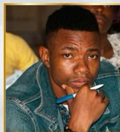
General Jesse Jackson